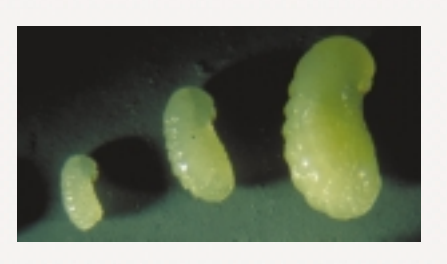
These larval instars will develop into different size workers.

Larvae molt four times over a 12- to 15-day period. The first three instars are fed regurgitated liquid food.